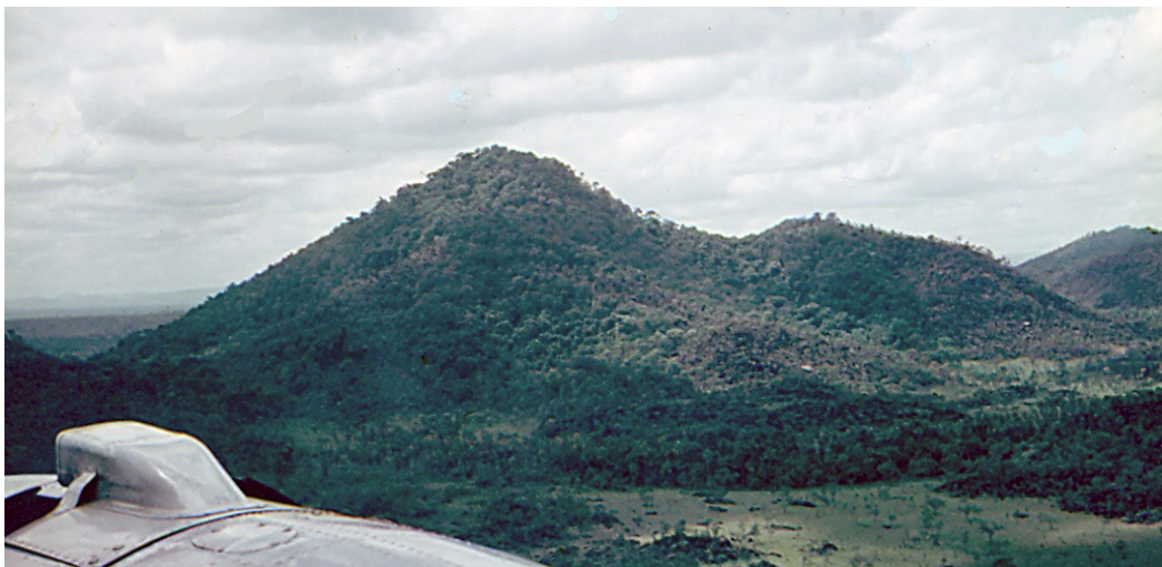
Vier Gebroeders Mountains, home of the blue arrow poison frog.